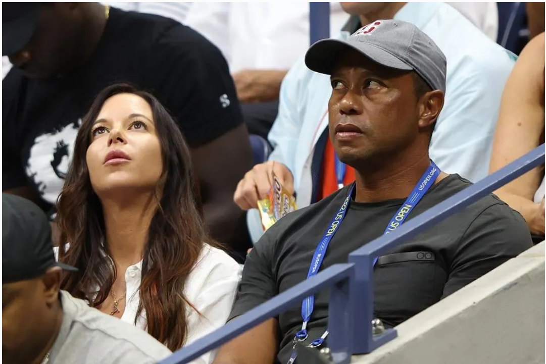
Erica Herman and Tiger Woods at the USTA Billie Jean King National Tennis Center on August 31, 2022.